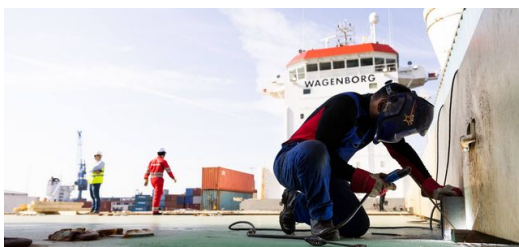
TRUMPF is one of the first industrial companies in Germany to charter its own deep-sea container ship.