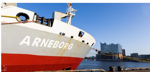
The container ship is scheduled to arrive in New York in about two weeks.