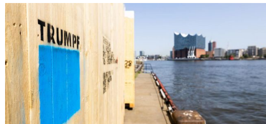
The ship is loaded in Hamburg, with the Elbphilharmonie in the background.