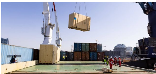
Heavy-duty cranes recently loaded the ship with 49 laser cutting machines and production parts.

In 2021, companies such as Coca-Cola, Walmart and IKEA had already rented their own ships in the USA.