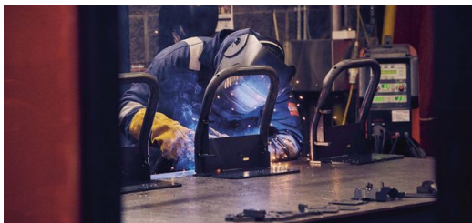
Hutchinson Engineering employs 100 people making products for customers from a variety of sectors ranging from bus manufacturers to the aviation industry.