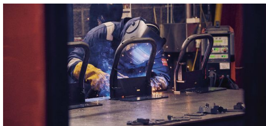
Hutchinson Engineering employs 100 people making products for customers from a variety of sectors ranging from bus manufacturers to the aviation industry.