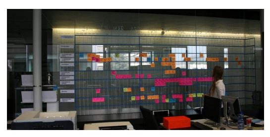
The traditional kinds of project-management methods that require a computer didn't provide proper transparency to each and every individual.

definitely expected to step up and say what the next steps will be.