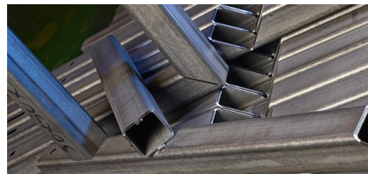
The technology package for bevel cuts provides high-quality 45° cuts. The great cutting speed also makes this highly productive.