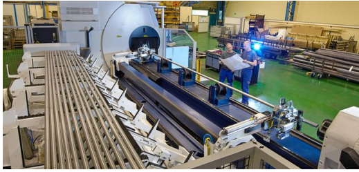
The 3D CAD system made by TRUMPF already contains, and automatically suggests, numerous design aids for tubes and profiles. A custom solution for unusually complex structures puts ProfilaseRichter in a position to offer services entirely beyond the usual standards.