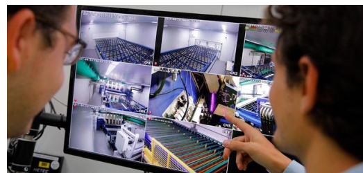
Heating the glass coating very briefly to a high temperature is an essential part of the hardening process. The glass experts at Saint-Gobain spent five years working on their rapid thermal processing method.