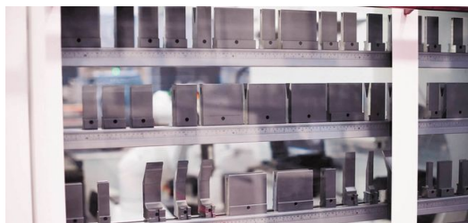
To manage production peaks, Giacomo Bianchi invested in tools that allow parts to be produced on both the TruBend Cell 7000 and the TruBend Cell 5000.