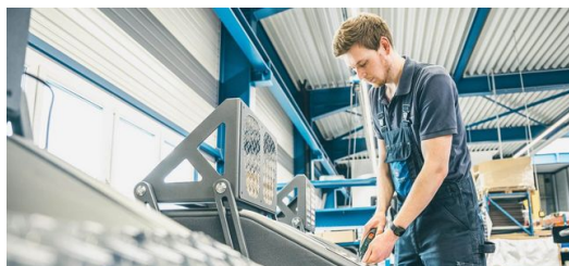
The TruMatic 7000 cuts and shapes the aluminum checker plates for the EGYM units scratch-free and in top quality.

70% of the frame of the unit consists of visually attractive oval tubes made of sturdy mild steel. "We use both our TruLaser Tube 5000 and our TruLaser Tube 7000 for processing. Both are equipped with the bevel cutting option and can insert threads." What would normally take several work steps to implement in conventional manufacturing, TRUMPF's laser tube-cutting machines accomplish in just one operation. The aluminum checker plate for placing the legs comes scratch-free from the TruMatic 7000 , and the TruBend 7036 Cell takes care of the necessary bending edge for fastening to the frame. The electronics and some plastic parts are supplied to Steinhart. After the frames are powder coated, all components are assembled into complete units.