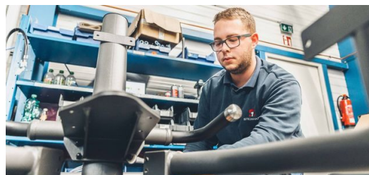
The frame of an EGYM exercise machine consists of primarily oval steel tubes. After processing on a TRUMPF laser tube-cutting machine, it is given an elegant dark gray finish by powder coating.