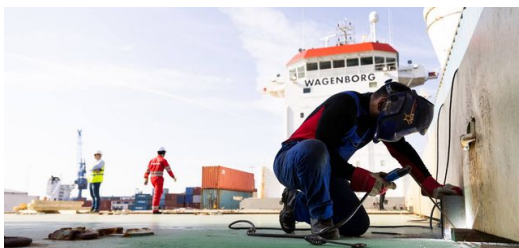
TRUMPF is one of the first industrial companies in Germany to charter its own deep-sea container ship.