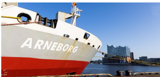
The container ship is scheduled to arrive in New York in about two weeks.