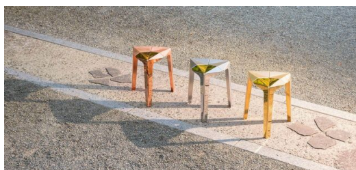
<p>The "Orisu" chair in different colors: a symmetrical object, made of uniform parts and folded metal like origami.</p>