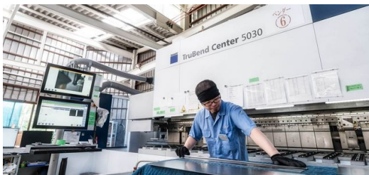
<p>An employee working with the <a href="https://www.trumpf.com/en_INT/products/machines-systems/bending-machines/trubend-center-series-5000/">TruBend Center 5030</a>. This is how the "Orisu" chair is made.</p>

KANEYOSHI manufactures Ishida's design with TRUMPF machines. This offers advantages: "On TRUMPF machines, I can use different manufacturing processes within a short time. This allows me to finish the product faster," Yoshida explains. The production of the chair shows what the KANEYOSHI company is capable of: First, lasers cut uniform components from sheet metal. When bent in the right places and welded together, these components finally make up the finished object like puzzle pieces. The designer and Yoshida choose the material quite deliberately: "Unlike wooden products, sheet metal has the advantage that its strength can be increased simply by bending it. So we don't need any additional components to assemble the chair. This saves material and weight," explains Ishida.