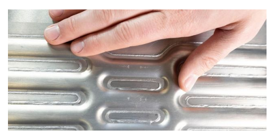
In the folding-box concept developed by BENTELER for a stainless steel battery housing, the patented TRUMPF solution BrightLine Weld ensures spatter-free processing and high-strength gas- and helium-tight weld seams, even in rapid series production.