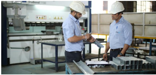
<p><span lang="EN-IN">Quality guaranteed: Engineers at JBM are inspecting the parts made with the TruBend 1100 press brake.</span></p>