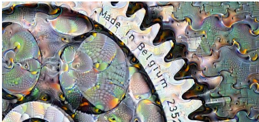
The dream in the workpiece?