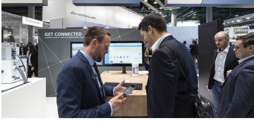
All 3D printers at the exhibition stand were connected to a digital MES

learn how much it will cost to produce the component and how long delivery will take. On top of that, the manufacturer can access the printers and the pending jobs' process data from anywhere in real time.