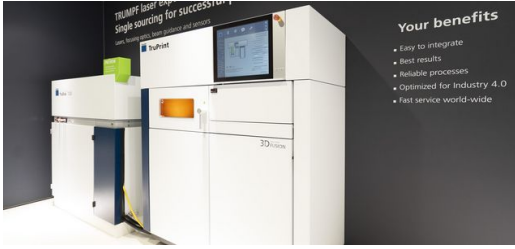
TRUMPF prints copper and gold with a new green laser

For another first at Formnext, TRUMPF printed pure copper and gold using a green laser. The company's developers achieved this by linking the new TruDisk 1020 disk laser and TruPrint 1000 3D printer. The former's wavelength is in the green spectral region, and unlike infrared lasers, it is able to weld highly reflective materials such as pure copper and gold. None of the expensive material goes to waste, which the jewelry industry is sure to appreciate. And the electronics and automotive industries benefit from components made of pure copper, an excellent conductor of electricity and heat.