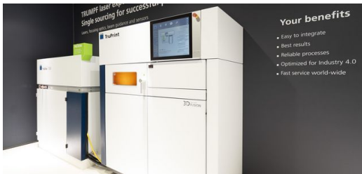
TRUMPF prints copper and gold with a new green laser

For another first at Formnext, TRUMPF printed pure copper and gold using a green laser. The company's developers achieved this by linking the new TruDisk 1020 disk laser and TruPrint 1000 3D printer. The former's wavelength is in the green spectral region, and unlike infrared lasers, it is able to weld highly reflective materials such as pure copper and gold. None of the expensive material goes to waste, which the jewelry industry is sure to appreciate. And the electronics and automotive industries benefit from components made of pure copper, an excellent conductor of electricity and heat.