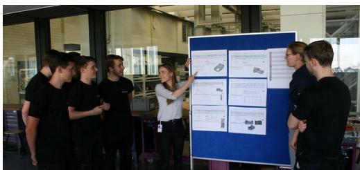
The idea is to actively involve 170 students and apprentices from different departments in the project over the next three years, and to accompany them on that journey.