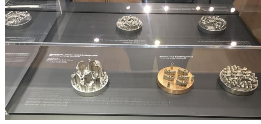
Substrate plates with 3D-printed dental prosthesis.