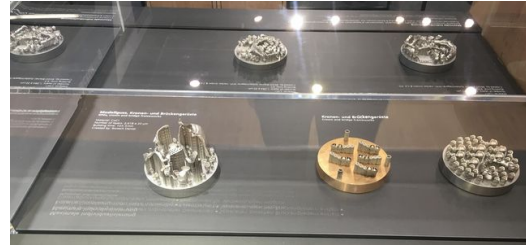
Substrate plates with 3D-printed dental prosthesis.