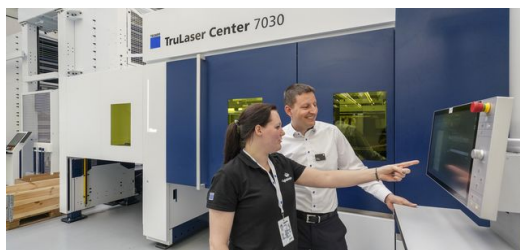
Agile methods have long been used in software development, but now they are making inroads into other areas such as mechatronics. The fully automated TruLaser Center 7030 was developed using agile methods.

"There are certain tasks where agile might not be the best approach, however. That's why we're not aiming to abandon methods that have worked well for TRUMPF in the past, but rather to combine both approaches," says Schlegel.