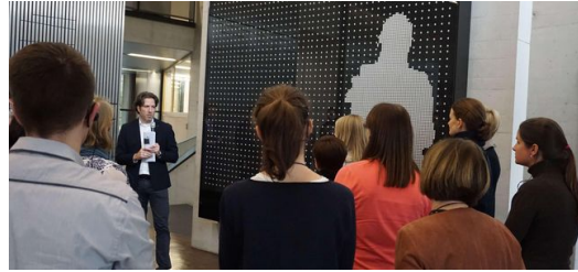
A good two dozen colleagues gathered in the lobby of the sales and service center to find out about the new Welcome Passage.