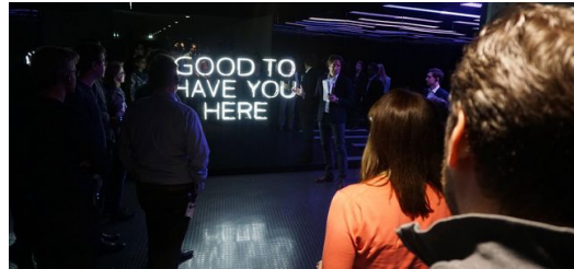
The words in the TRUMPF own tunnel system has been handcrafted exclusively for the company. Electrodes excite the gas in the tubes that form the words, making it light up.