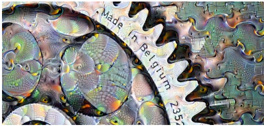
The dream in the workpiece?