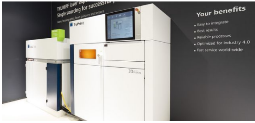
TRUMPF prints copper and gold with a new green laser

For another first at Formnext, TRUMPF printed pure copper and gold using a green laser. The company's developers achieved this by linking the new TruDisk 1020 disk laser and TruPrint 1000 3D printer. The former's wavelength is in the green spectral region, and unlike infrared lasers, it is able to weld highly reflective materials such as pure copper and gold. None of the expensive material goes to waste, which the jewelry industry is sure to appreciate. And the electronics and automotive industries benefit from components made of pure copper, an excellent conductor of electricity and heat.