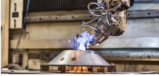
ELFIM uses the LaserCell 1005 for various applications of laser technology such as 2D and 3D cutting or welding and also for laser metal deposition.

perform a 3D scan of an existing replacement part.