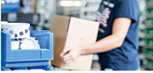
Packing: The person in charge of packaging is notified as soon as an order is complete.