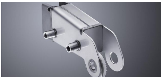
TRUMPF Medizin Systeme setzt in der OP-Tisch-Fertigung auf die Pluspunkte vom Laserschweißen.

This article was first published in May 2014.