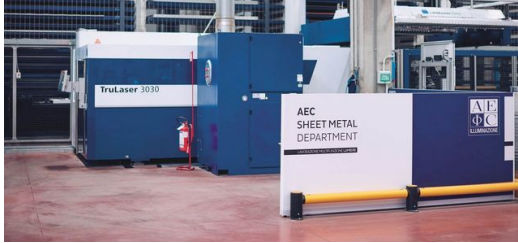
The TruLaser 3030 fiber 2D laser-cutting machine laid the foundations of AEC Illuminazione's close partnership with TRUMPF. Its connection to an automated storage system made production much faster.

achieve this, Bianchi has now connected up 85 percent of the company's machines. The MES generates production schedules and ensures smooth operation of the manufacturing environment. The design engineers can send their CAD drawings straight to the machines, where the data is imported and turned into finished parts as and when they are needed. The MES also collects machine data and key metrics for quality monitoring, machine utilization and production status. "By connecting everything together, we've created a truly transparent production environment. Tailoring our production schedules to the needs of our employees and machines helps to shorten throughput times and improve on-time delivery over the long-term," says Bianchi.