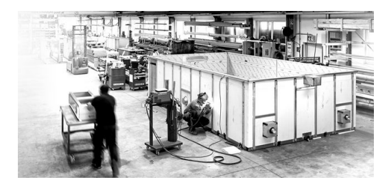
In one piece: Pools with standard dimensions are fully finished at Gassner and transported to the installation site on flatbed trucks.