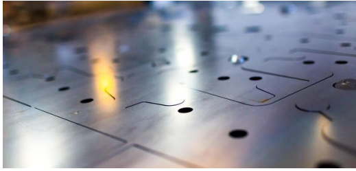
CoolLine is a function that enables targeted workpiece cooling and thus to nest components much more tightly than before.