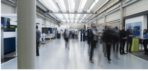
Visitors also crowded to the 2D laser cutting machines.