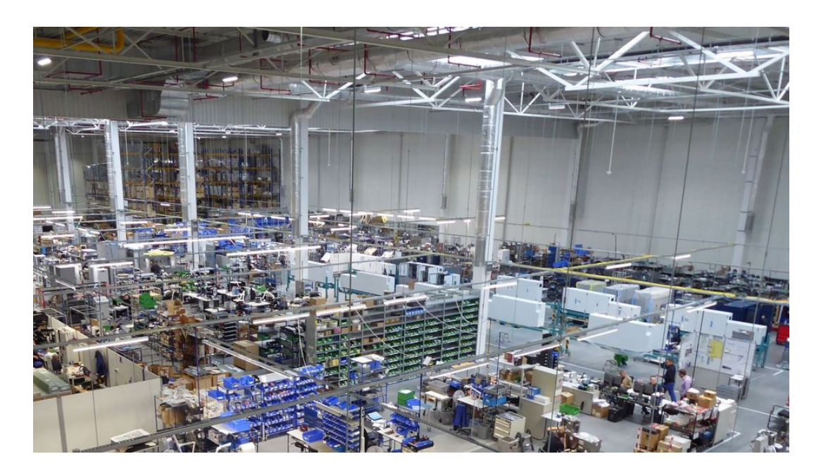
The Ukrainian employees work in production in Marki. TRUMPF Hüttinger manufactures modules for control cabinets there.