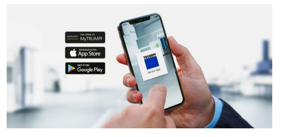
The TRUMPF Service app is available for download from Google Play or the Apple App Store.