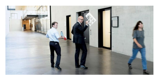
The team of people from the product group, development, purchasing, production, sales, service and project organization departments meets at regular intervals to discuss how development on the TruLaser Center 7030 is progressing.