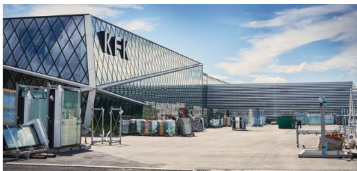
The KFK building in Croatia.

KFK used to focus predominantly on customers from Croatia, but today the company is involved in projects all over the world. "Right now we're focusing on the UK, which is currently experiencing a boom in construction. All the world's big cities are constantly striving to make buildings that are taller, more sophisticated and even better quality, and London is no exception," says Papac. He is particularly proud of the biggest project KFK is working on at the moment: "It's a residential building in London, the tallest structure of its kind currently under construction anywhere in Europe. With 76 floors and at 233 meters tall, it's a project that obviously requires the production of lots and lots of facade modules." It takes several years to complete projects on this scale – three and a half years in this case.