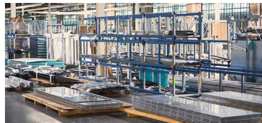
A one-stop service provider: KFK set up its own glass production facility measuring approximately 360 meters long in 2017.