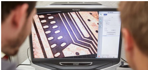
Part of the visual inspection involves documenting homogeneous ablation. The ablation zone is dark and shows the plastic surface. The key to successful machining is to ablate the gaps cleanly to provide electrical insulation between the conductive tracks.