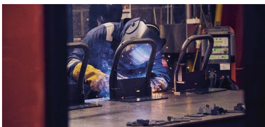
Hutchinson Engineering employs 100 people making products for customers from a variety of sectors ranging from bus manufacturers to the aviation industry.