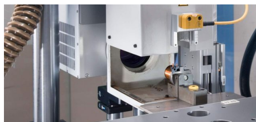
<p>TruMark 5010 </p>