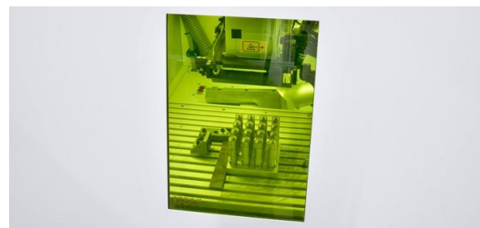
<p> TruMark Station 5000</p>