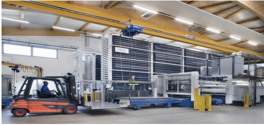
<p>LiftMaster Compact TruLaser 5030 fiber STOPA Krämer </p>