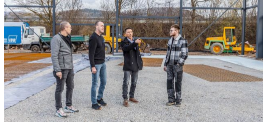
DELO 2023 9 2,000