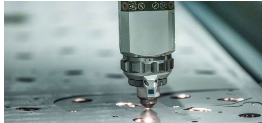
<p><span></span> HighSpeed Eco <span></span> DELO <span></span> 3 <span></span> 20 <span></span> 70% <span></span></p></p>