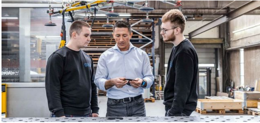
<p><span></span><span></span> TruLaser 1030 fiber <span></span> Denis Lozusic <span></span></p></p>