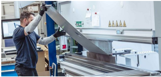
<p>MERZ TRUMPF Oseon </p>