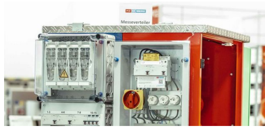
<p>MERZ GmbH 2005 MERZ PCE</p>