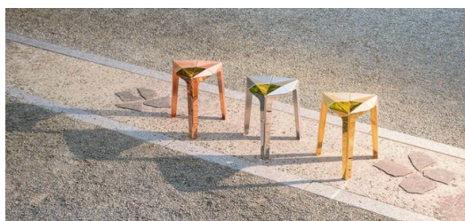
<p>The "Orisu" chair in different colors: a symmetrical object, made of uniform parts and folded metal like origami.</p>