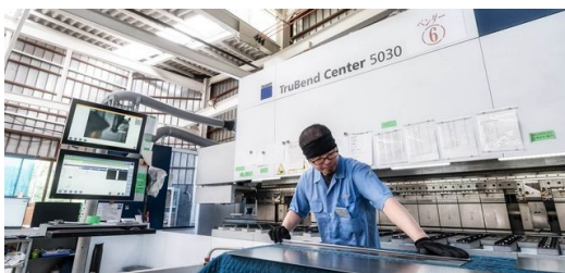
<p>An employee working with the <a href="https://www.trumpf.com/en_INT/products/machines-systems/bending-machines/trubend-center-series-5000/">TruBend Center 5030</a>. This is how the "Orisu" chair is made.</p>