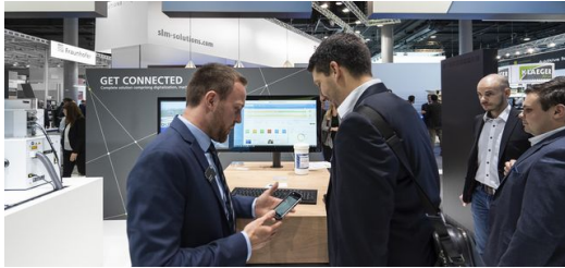
All 3D printers at the exhibition stand were connected to a digital MES

learn how much it will cost to produce the component and how long delivery will take. On top of that, the manufacturer can access the printers and the pending jobs' process data from anywhere in real time.