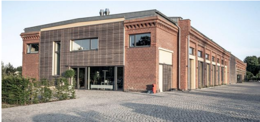
<p>The Potsdam-based company Miethke produces high-tech medical devices that are implanted in people's brains and bodies.</p> – Leon Zwiener

That sparked his interest in the whole issue of surfaces. "Right now we're experimenting with ways of using the laser to create hydrophobic and hydrophilic surfaces on our parts. It seems that once you get hold of an ultrashort pulse laser, you are constantly finding new things you can do with it!"