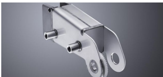
<p> TRUMPF Medizin Systeme setzt in der OP-Tisch-Fertigung auf die Pluspunkte vom Laserschweißen.</p>

This article was first published in May 2014.