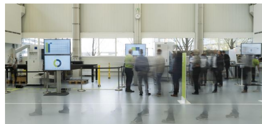
In the Showroom, employees produced a sheet metal part live. Screens displayed important manufacturing information.