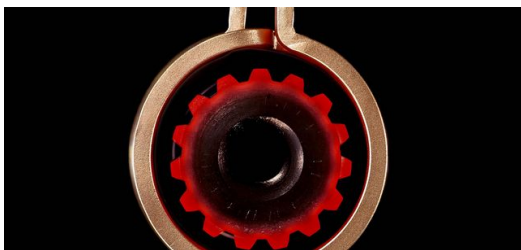
Inductive hardening of a gear part: Like the laser, induction is extremely local. Good conditions for efficient cooperation in flexible process chains.