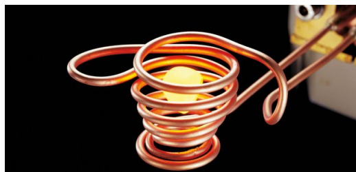
A coil envelops a fusion crucible. The material to be melted is put into the crucible and heated. Alternating current flowing through the coil, generates an electromagnetic field which transfers the electrical energy to the melting stock in a non-contact manner.

Applications range from work at room temperatures to work at several thousand degrees Celsius. As of 200 degrees Celsius, things start to get interesting for metal processing and laser technology. Above this temperature, many non-metallic protective and functional coats evaporate. This means that the same inductor that pre-heats the weld spot can now also clean or decoat this spot — and this spot only. At temperatures exceeding 900 degrees Celsius, workpieces can be hardened or softened locally. When it comes to induction, the possibilities are just about endless.