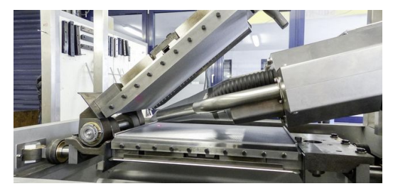
Despite the lack of space between the baking plates, the laser cleans them quickly and reliably.

Having now found the right tool and process, the next step for Kalss was retrofitting the laser for its new day job as a cleaning agent in a wafer factory. He called on systems integrator Robert Binder to help him solve a seemingly contradictory problem. "In our ovens, the baking plate pairs only open up to an angle of 30 degrees. This prevents excessive heat loss when the batter is poured in or the wafer sheets are removed," says Kalss. "But in order to clean our ovens, we require the surfaces to be as accessible as possible."