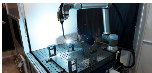
The automated welding cell that is easy to program, has many parameters already integrated and at the same time meets high quality standards: the TruArcWeld 1000 from TRUMPF.