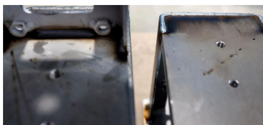
Consistently high quality welds and fast set-up: Automated welding with the new welding cell brings considerable advantages for zweifel metall ag.