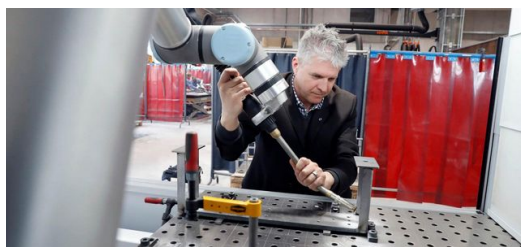
The TruArc Weld 1000 is the entry into simple welding for the company zweifel metall ag.