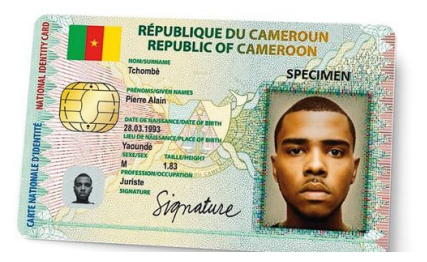
Over the next few years, every citizen of Cameroon will get a personal identity card made using an RGB laser.